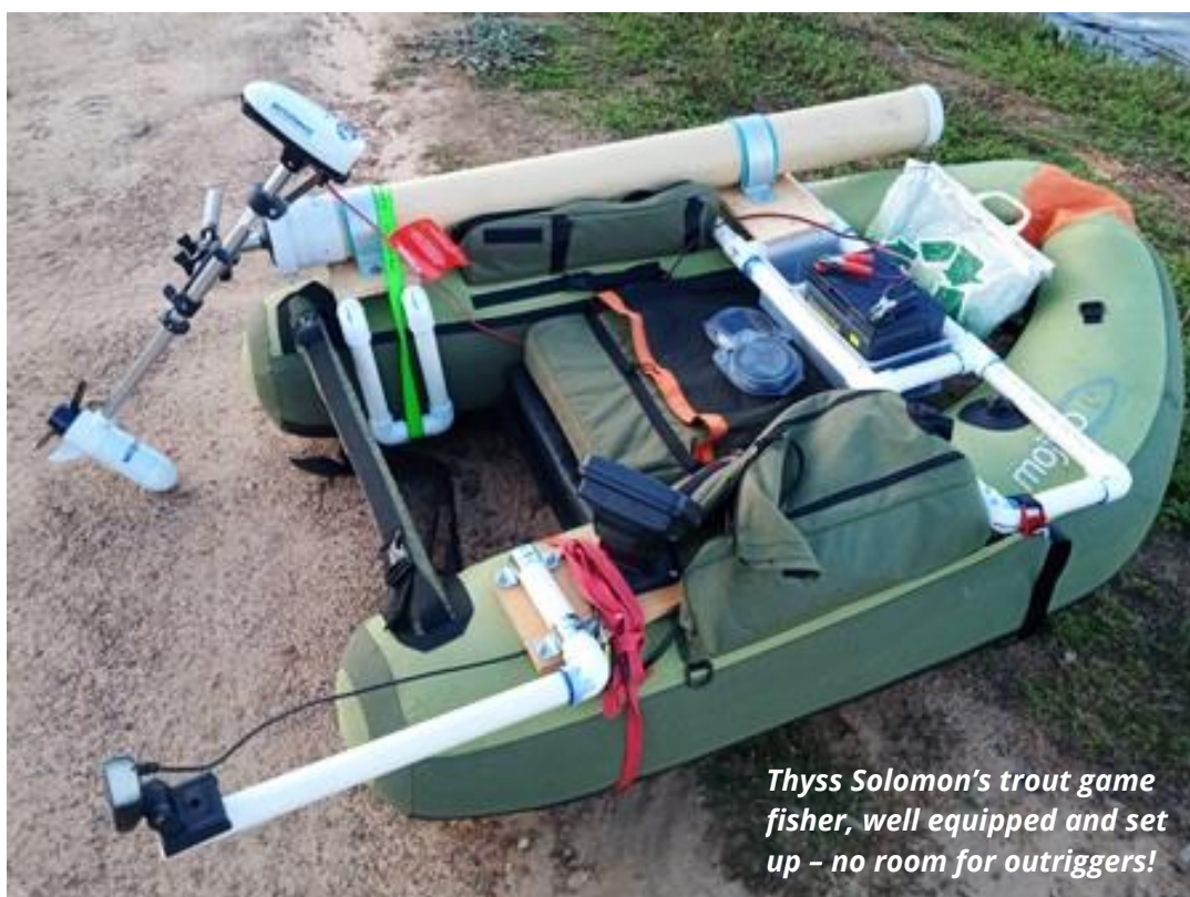
Thyss Solomon's trout game fisher, well equipped and set up - no room for outriggers!