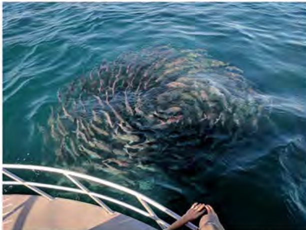
A pink snapper aggregation in Cockburn Sound near Garden Island

"Pink snapper is one of the key indicator species of the West Coast demersal scalefish resource and we have been working to rebuild those demersal scalefish stocks since 2008."