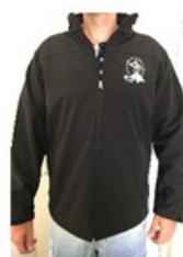
Jacket – ideal for cool mornings and winter outings

Navy blue $40 each plus $10 for boat name