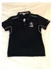
Polo Shirt – Short sleeve

Members can order the shirts with their boat names embroidered on the sleeve or front.