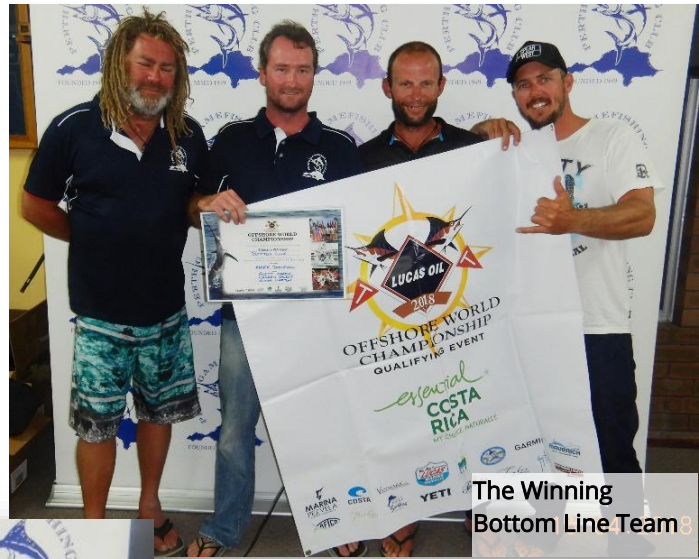
The Winning Bottom Line Team 3

All told, the competition was once again a success with the scoring fish being a small percentage of the total fish caught. Diversity of species, the high expectations of success and the friendly nature of the event again made it a very pleasurable experience for all participants.