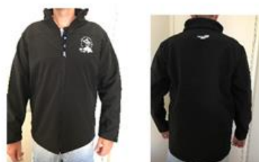
Jacket – ideal for cool mornings and winter outings

Navy blue $40 each plus $10 for boat name