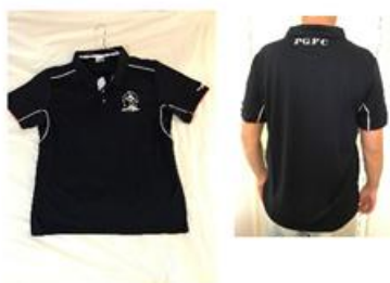
Polo Shirt – Short sleeve

Navy blue $40 each plus $10 for boat name