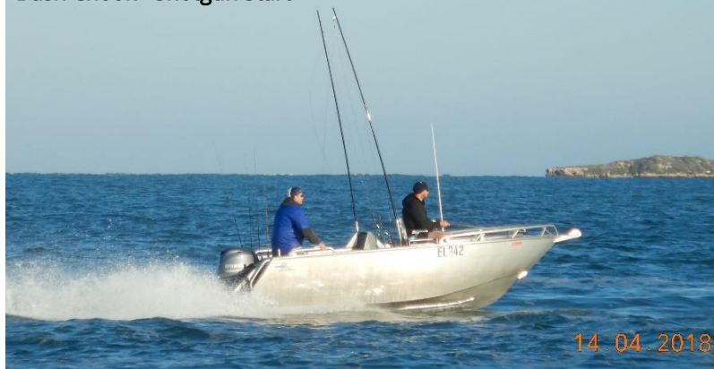
Bush Chook - Shotgun Start