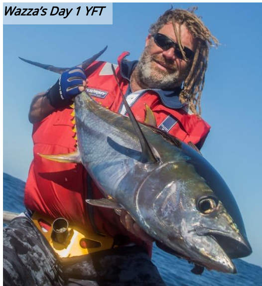
Wazza's Day 1 YFT

Saturday morning's sailpast and shotgun start had the fleet belting enthusiastically towards the north passage where crews were greeted by 4m south westerly swells topped with a 1m south easterly chop. When combined with the residual southerly chop from overnight, and a current setting to the south, it was not pretty. This did not deter the anglers in boats from 4.5 to 12.2m.