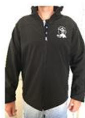
Jacket – ideal for cool mornings and winter outings

Navy blue $40 each plus $10 for boat name