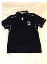
Polo Shirt – Short sleeve

Members can order the shirts with their boat names embroidered on the sleeve or front.